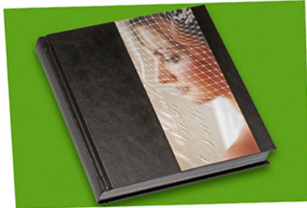
Two tones with photomontage